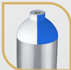
ENTONOX (O 2 + N 2 O)