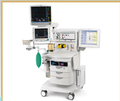
N2O & Co2 CYLINDER FOR ANESTHESIA MACHINE