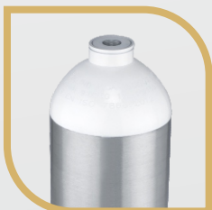
Oxygen (O 2 )

Mixture of Nitrous Oxide & Oxygen Gas Kit is also known as Pain Relief Gas has been used in Pain Relief, Sedation and Anesthesia, Since many years.