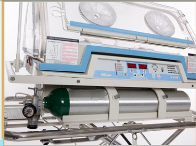
O2 CYLINDER FOR BABY INCUBATOR