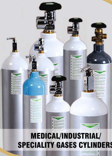
MEDICAL/INDUSTRIAL/ SPECIALTY GASES CYLINDERS

25E IND ALGAN S0002 84MM 9.00KG 10L PW150 EN ISO 7866:2012