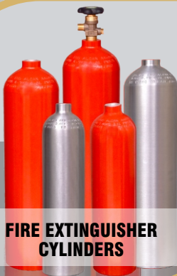
FIRE EXTINGUISHER CYLINDERS