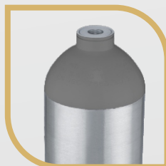
CARBON DIOXIDE (CO 2 )