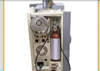
HELIUM CYLINDER FOR IABP MACHINE

Oxykit's Lightweight, Portable & Non Magnetic Aluminium Cylinders are widely used for Medical Gases in ICU, NICU, Operation Theatre, Emergency Ward, Incubator, Anesthesia Machine, Stretcher and Ambulances