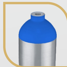
NITROUS OXIDE (N 2 O)