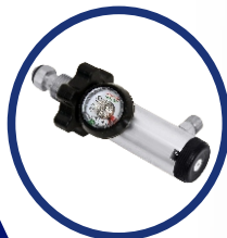
Bull Nose Regulator