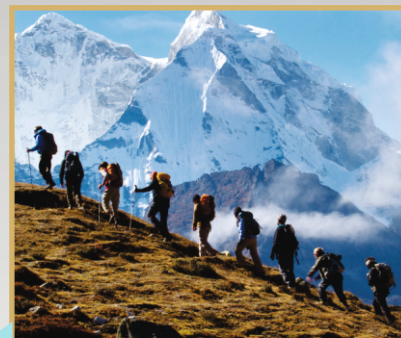
HIGH ALTITUDE & TREKKING