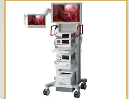
Co2 CYLINDER FOR LAPAROSCOPY MACHINE