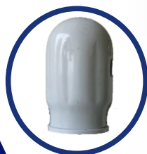
Metal/ Aluminium Valve Guard